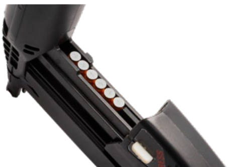
10 Pin Magazine (75mm Pins) Increased fixing rates.