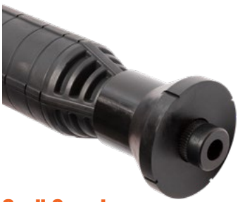
Spall Guard Can be fitted to single shot fastener guide - protects from flying debris.