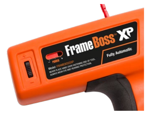
Strip Loads Industry standard charges